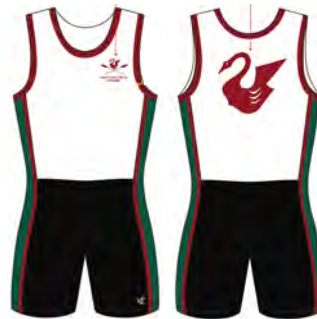
WBHS Rowing zoot suit