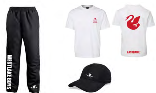
Optional training gear