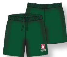
PE & SPORT SHORTS