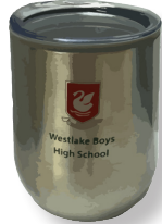
ALUMINIUM - METAL