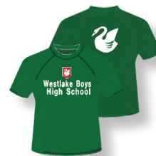
RUGBY WARMUP TOP