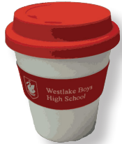
PLASTIC SCREW TOP