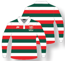
STRIPED RUGBY JERSEY