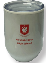
ALUMINIUM - WHITE