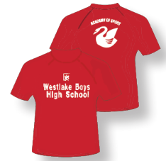
ACADEMY OF SPORTS TOP