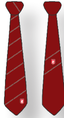
SCHOOL / YR 13 TIES

8/10/12/14/S/M/L/XL/2XL/3XL 4XL/5XL $50.00